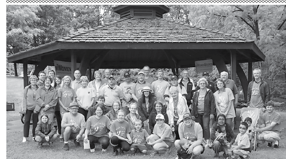
WomenSource Walk for Life participants.